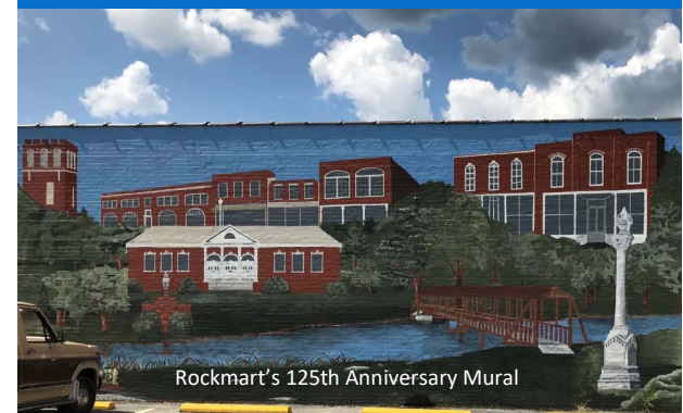
Rockmart's 125th Anniversary Mural