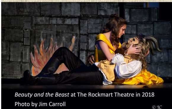
Beauty and the Beast at The Rockmart Theatre in 2018

The Rockmart Theatre is utilized year-round by the Rockmart Community Chorus, Community Theatre, the High School Theatre Department, local singers and songwriters, dance studios, and other groups for various benefits and performances.